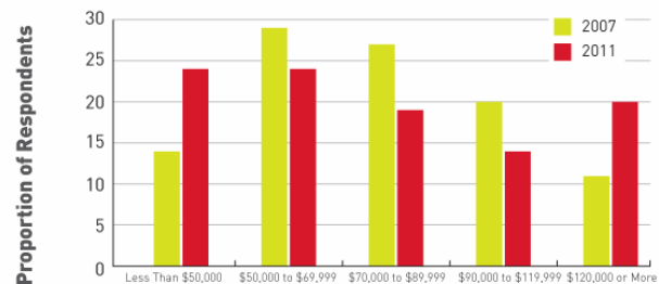
FIGURE 2 Shift in Salary Distribution (2007-2011) n=1,997

This does not mean that salary advancement is out of the question. L&D professionals received healthy increases last year, and they can improve their compensation prospects by investing in their own human capital—gaining further education and professional certifications and more experience in the L&D field. Those looking to improve their odds of higher salaries can target higher-paying regions, industries, organizations, and L&D departments.